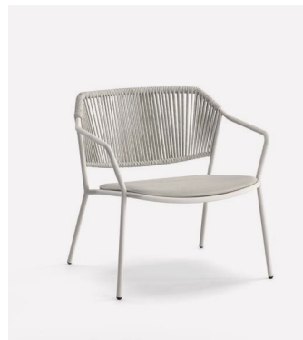
1524 - LOUNGE CHAIR