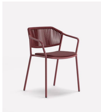
1522 - ARMCHAIR