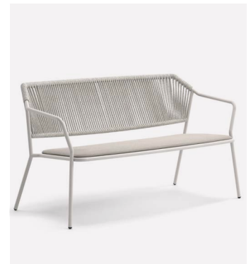
1527 - 2-SEATER SOFA