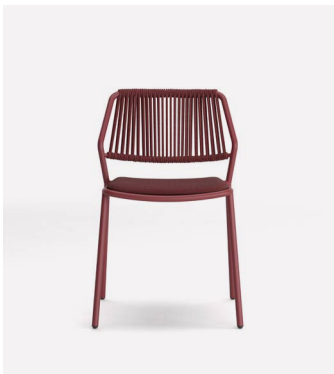
1521 - CHAIR