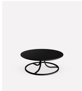
1356+1340 - COFFEE TABLE WITH STEEL SHEET TOP W/D/H: 80x80x32 cm WEIGHT: 11 kg