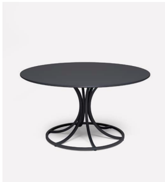
1358+1344 - ROUND TABLE WITH STEEL SHEET TOP W/D/H: 142x142x75,5 cm WEIGHT: 53,8 kg