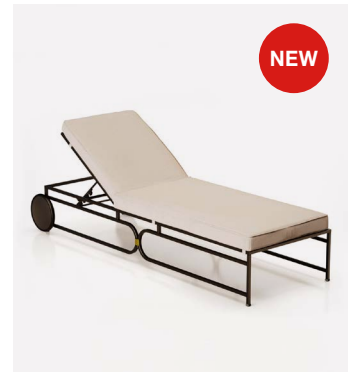
1347 - SUNBED