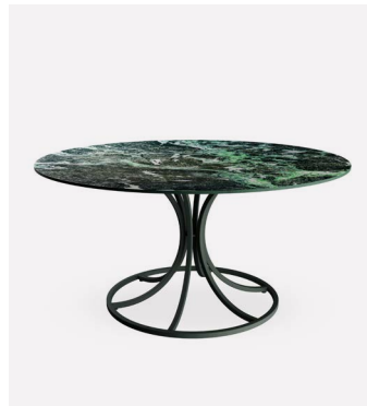
1358+1344 - ROUND TABLE WITH PORCELAIN STONEWARE TOP W/D/H: 150x150x73,5 cm WEIGHT: 72,8 kg