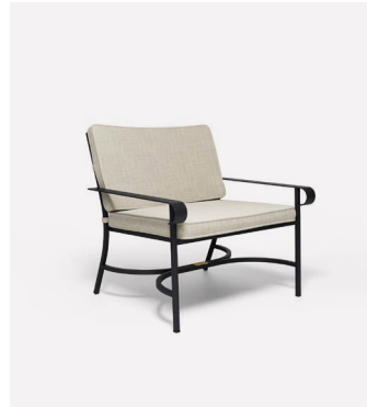
1352 - LOUNGE CHAIR