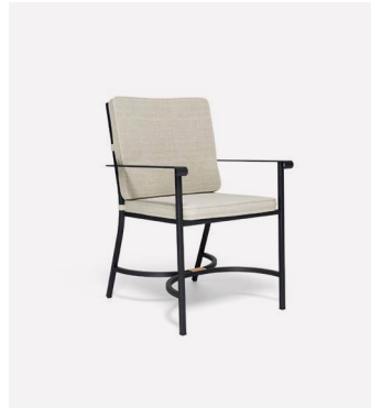
1351 - ARMCHAIR