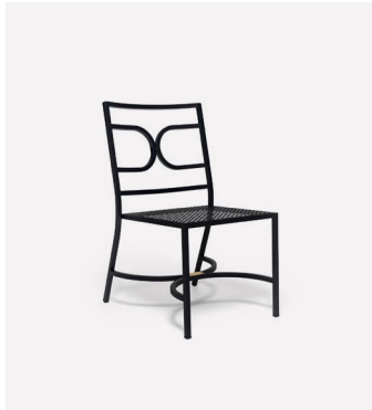
1350 - CHAIR