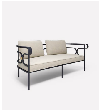
1366 - 2-SEATER SOFA