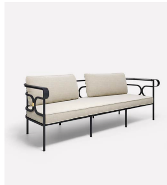
1367 - 3-SEATER SOFA