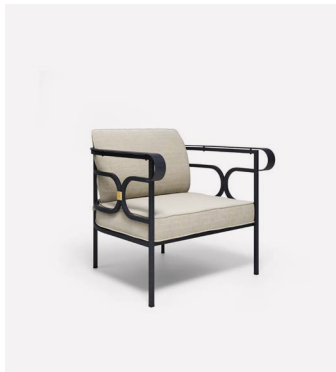
1365 - 1-SEATER SOFA